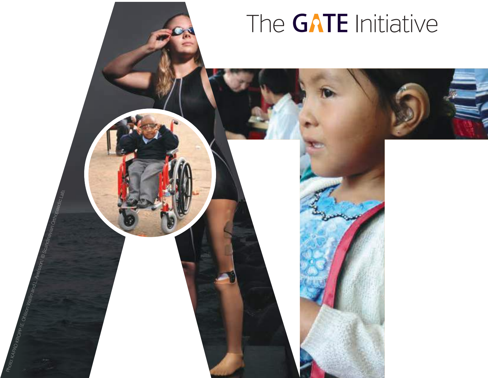
Photo: KAPAD KROPP (E. Ohlsson Wallin and L. Axelsson) © Scandinavian Orthopaedic Lab.